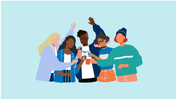
Alcohol Use Disorder: Harm and Risk Reduction Strategies