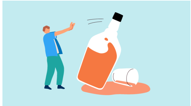
Alcohol Use Disorder: Epidemiology and Clinical Best Practices